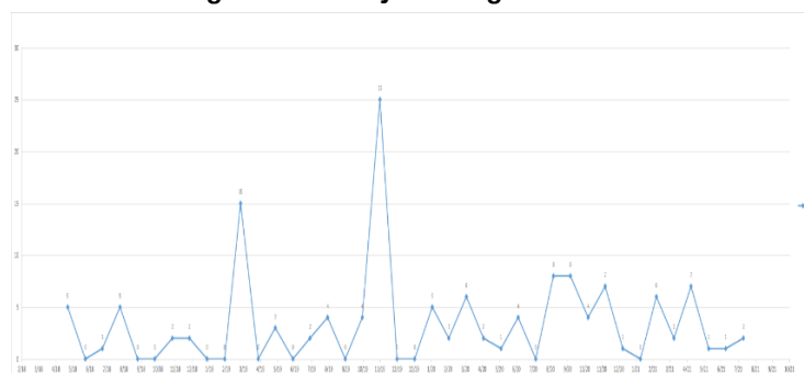
Figure 2 Monthly coverage statistics

In general, the coverage of Chongqing by Korean media is relatively small. Kyeonghyang News is one of the six major comprehensive daily newspapers, and Culture Daily is an influential cultural newspaper in Korea. However, neither did any reporting on Chongqing with 41 months. And the average monthly level of coverage is less than 4. As shown in Figure 1, out of the 41 months, there were 39 months in which reporting volume was only in the range of 0-9. Two reporting peaks occurred in March and December 2019 respectively.